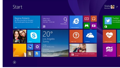
Windows 8, 8.1