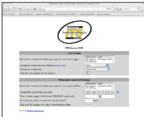
Main Surveillance Window

The ITS Hosted Surveillance System is easy to install and use. The system uses network or analog cameras and video servers. The cameras are then recorded back to a DVR hosted in the ITS Data Center. Footage is available via an easy to use web interface. Cameras can have advanced functionality such as infrared night vision and pan tilt zoom (PTZ) functionality.